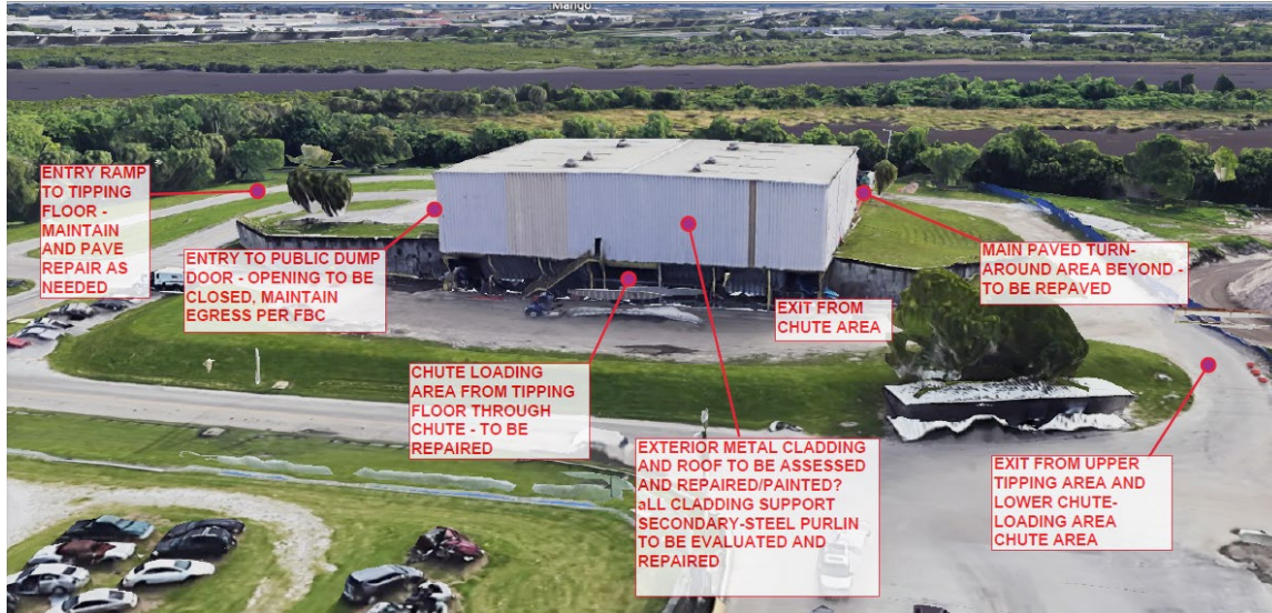
WEST ELEV: Storm damage typ. In various locations, and roof – Assess and Repair